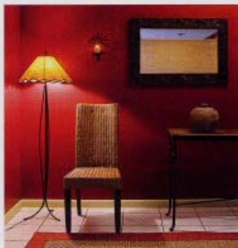
Top: The dining room–living room area looks out on a rock-garden atrium with a serene waterfall. Above: Glidden's Drum Beat red, from Home Depot, adds an Asian touch to the dining room.

Furnish with ethnic touches. We mixed ethnic flavors (Caribbean, Asian and African) from Pier 1 Imports' furniture collection to give the room a global feel. The owner already had a putty-colored sofa; we added Domingo console and coffee tables, two Papanga rattan trunks